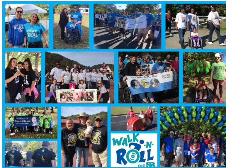
Walk N Roll