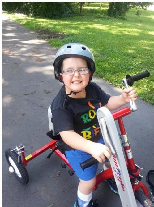
Adaptive Bike provided by SBAK's Financial Assistance Fund

Norton Children's Hospital - 231 E Chestnut St, Louisville, KY 40202 Director of Operations