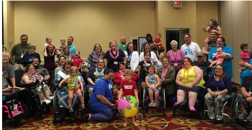
SBAK Regional Conference